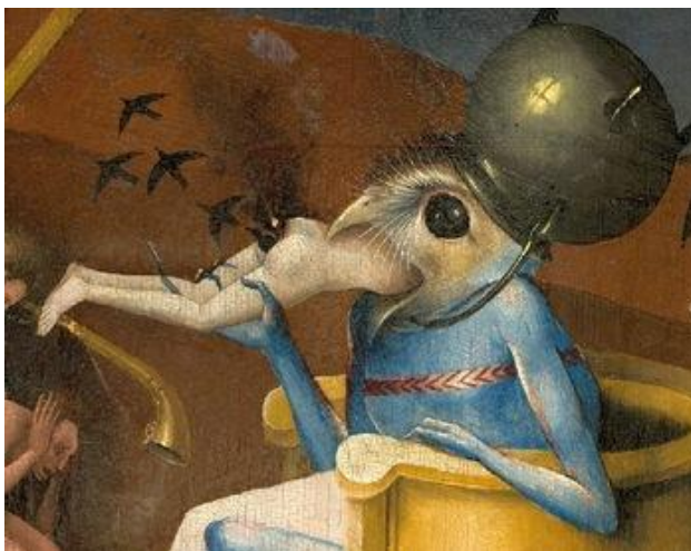
"this guy can't bring pillows because i ate him"

Come to the Saybrook-Branford Room at 7:30pm to share your thoughts!! Bring pillows if you want 'em!!