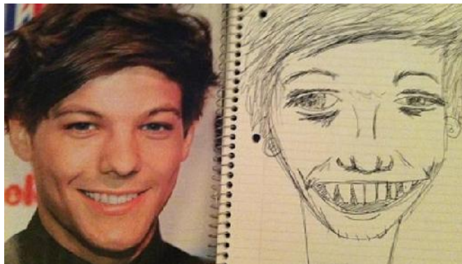
"so that means i get to be reborn right"

THIS IS THE LAST LIBGLOSS THAT WILL EVER POP. Enjoy, my lovely lovely... uh... turtles. Also, this coincides with the lovely week that is Bulldog Days!! What a lovely symbol of death but also rebirth.