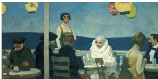
"i wish i were on the NY trip" -clown

Friday: NY Trip! contact Kenneth 4 the deets if you haven't already!