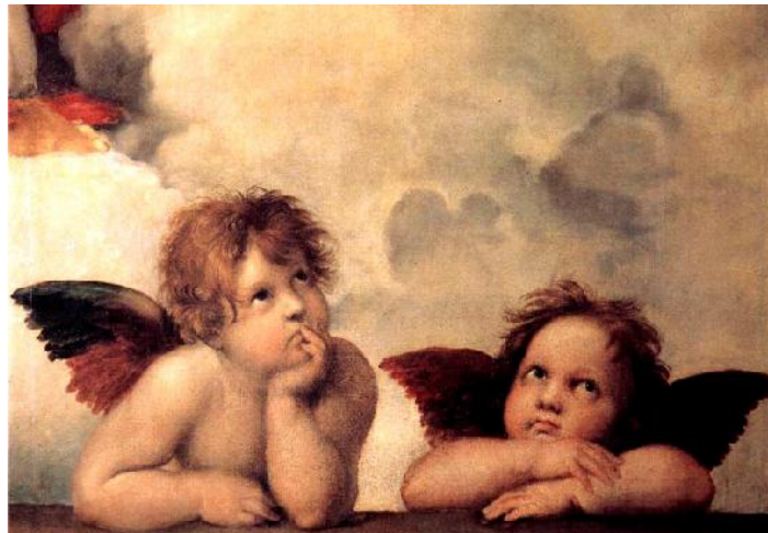
"hmmm," quoth the babby

Should we be making work accessible to everyone, even people society deems incapable of working? Or perhaps some larger questions: what is the value of work? Is finding and having a fulfilling job essential to "the good life"? Is work ever an end in itself?