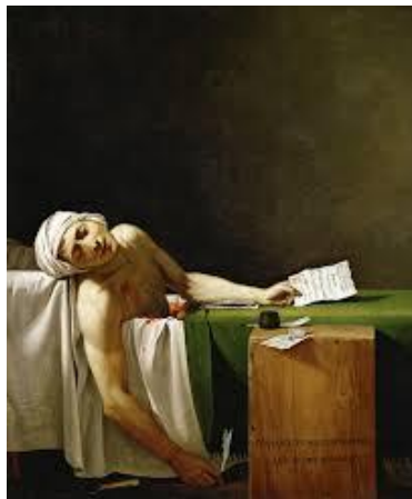
like this guy.