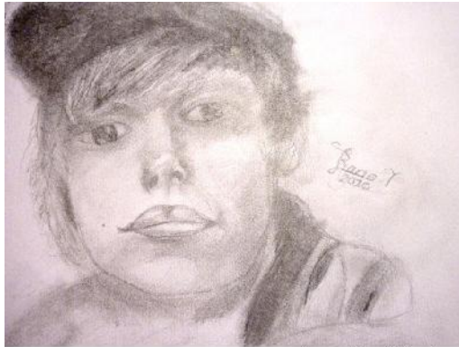
Dev. art. April - Tr iForUeLove

don't let me disappear from ur thoughts as justin disappears from the page