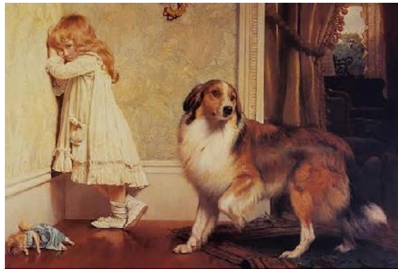
"no more libvents?"

Wed-nes-day: TOASTING!! Exciting!! Fancy Cup!! 8pm!! Undisclosed Location!! (erm, not really--we just don't know where it is yet and 'undisclosed location' is much... sexier)