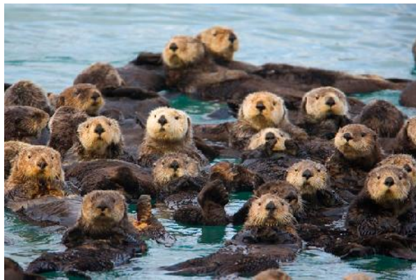
"we're a crew of otters haha"

Monday: LibDinner @ 5:30 in the 'houn. Love LibDinner! Love the 'houn and also eat there!