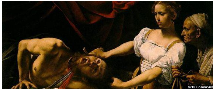
"what do u think, horizontal man?"

Be not deterred by the two-to-three feet of freezing death that will have descended upon us by Wednesday. No, friends, I implore you to, um, not be deterred. Come to Discussion! Wednesday, 7:30, Undisclosed Location come and discuss: Should hard drugs be banned?