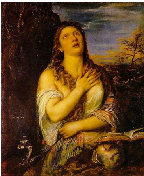
"omg i literally cannot wait"

Catan, so get ready to try your luck and walk away with zero glitter cards).