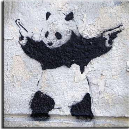
"you better come or gun panda will fck u up"

Wednesday: Join us for Discussion! At 7:30pm in an Undisclosed Location, the Libs will discuss: Can we be ethical tourists?