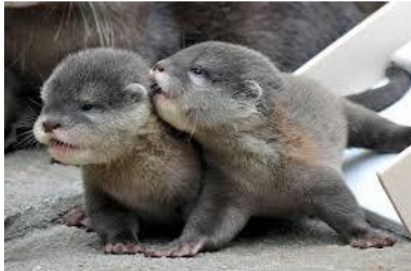
"i'll always be true to u turtle"

THIS IS THE LAST LIBGLOSS THAT WILL EVER POP. Enjoy, my lovely lovely... uh... turtles. Also, this coincides with the lovely week that is Bulldog Days!! What a lovely symbol of death but also rebirth.