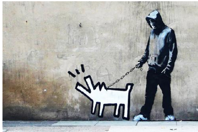
"hey man check out my new dog"

Saturday: The Libs will travel to East Rock!! At 11am!! Then Pepes!! At 5pm!! Walking AND eating!