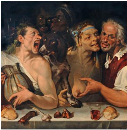
my face when I see food and friends in the same place

Well my-oh-my, are you in luck: tomorrow, Monday , the Libs will kick off the semester with our weekly Lib Dinner! We will be dining in the ever-fabulous Calhoun Dining Hall at 5:30pm . Be there or be square forevermore.