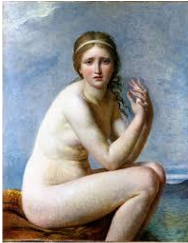
"so like... no sex?"